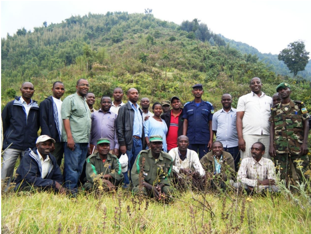
Ifoto y'abitabiriye iyi nama

Asoza inama uwari uhagariye Umunyamabanga Nshingabikorwa w'umurenge wa Ruhango, ahabereye ibikorwa byo gusura ishyamba, yashimye ibitekerezo byatanzwe, agaragaza ko ari byiza ko hakomeza ubufatanye mu kubungabunga ishyamba rya Gishwati. Yagaragaje imbaraga zubatswe mu baturije Gishwati ndetse n'ibikorwa birimo gutegurwa bigamije kubungabunga iri shyamba no kwitegura ba Mukerarugendo, Yizeza gukomeza kwongera imbaraga mu bikorwa byose kugirango ibyakozwe bitazasubira inyuma.