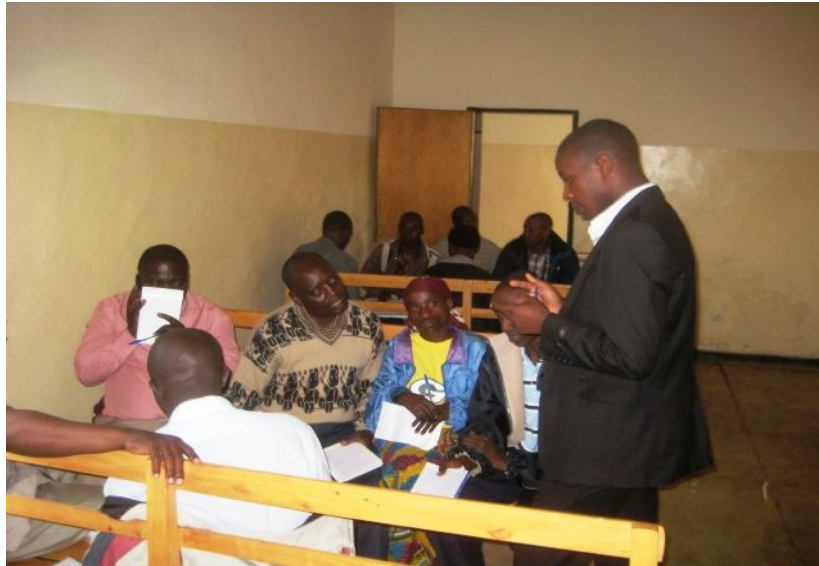
Workshop participants during the groups exercise

The next activity, in the same small groups, was to gather many ideas for increasing community participation in the protection and management of Gishwati Forest. They were asked to decide on what the next steps should be for creating community organizations around the forest to work in partnership with FHA and the Rwandan government for the protection of Gishwati. Finally, they considered who the key people should be who will animate this process and what the next steps are to continue after the workshop is concluded.